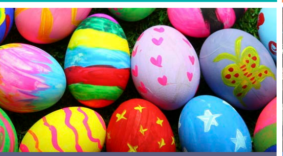
Decorate Easter eggs or candles!