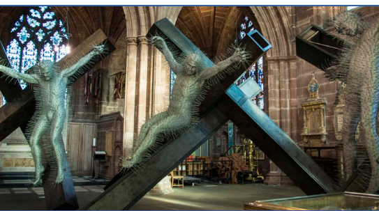
Ponder the fantastic 'Golgotha' exhibition by sculptor, David Mach