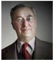
Wassily Kandinsky 1866-1944

abstract artist he loved using colours he used lots of shapes