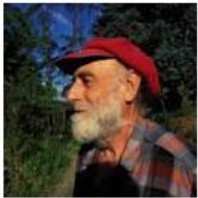
Friedensreich Hundertwasser 1928-2000