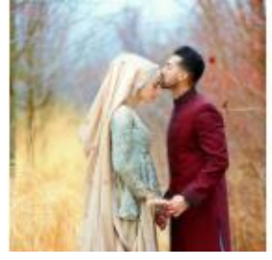
nikah — a Muslim wedding